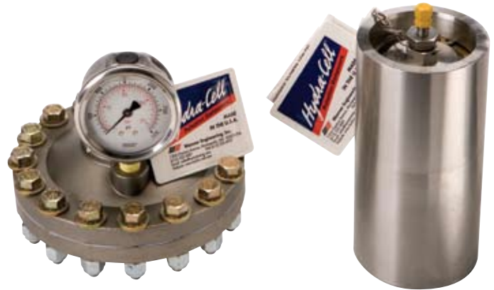
12ci dampener with PTFE bladder (left); all other materials (right).