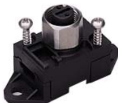
AS-i insulation displacement connector