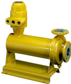
Standard Model HN