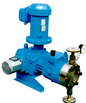
Metering Pump Series MX No leakage - High accuracy - High efficiency