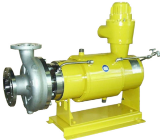
Model HT High Temperature cooled