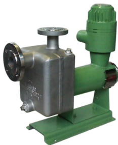
Model DN Self priming