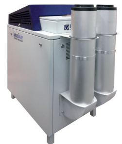
VATP 1600 incl. additional silencers