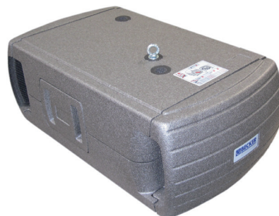
Rotary vane pump in sound proof box SH19/SH20